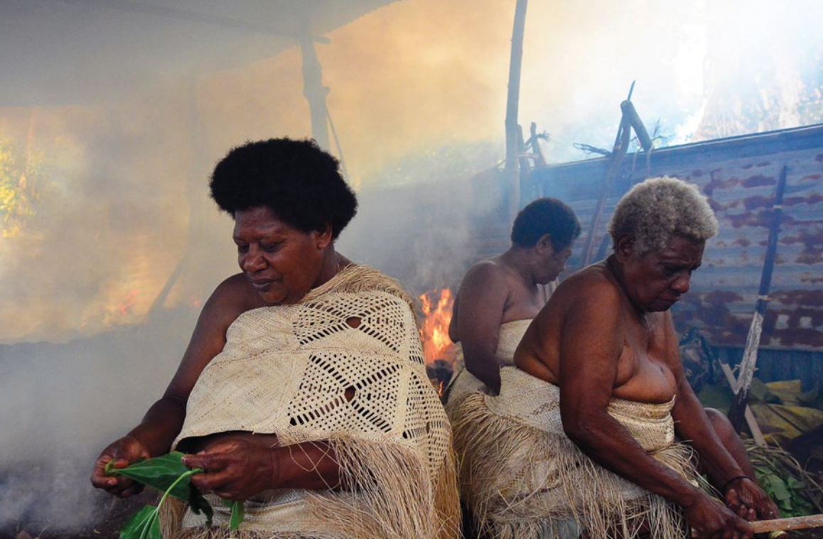
Previous page: The Notari (female custom leaders) of central Maewo assemble in Kerembei village for a custom and arts festival. While some contend that the Maewo Notari are in effect custom chiefs, the Maewo women themselves state in public that the correct term is Notari, not 'chief'. This page: Notari of Kerembei village wear their traditional mat dresses and sashes, while cooking the traditional way, with no metal pots or tools, only hot rocks and water and tools such as a sharp bamboo knife.

chiefs of Maewo would still be a key part of the festival.